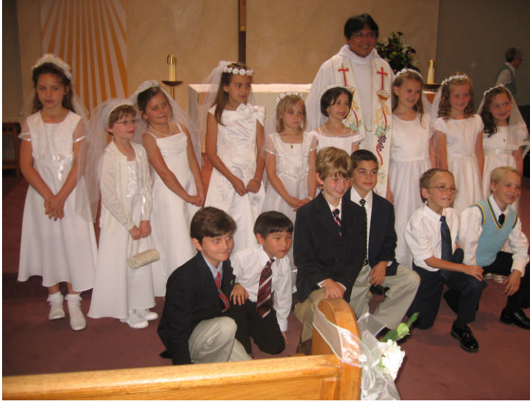
First Holy Communion May 18, 2008

Newsletter of the Church of the Transfiguration & St. John the Evangelist Parishes~ Vol. 1, Issue 1 (July, August, September) 7624 Roanoke Road, Fincastle VA 24090 ~ 99 Second Street, New Castle VA 24127